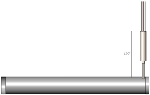
TURBULENT FLOW MCF HEATER